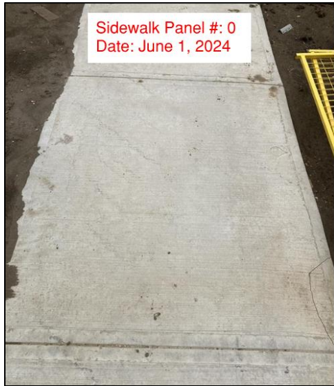
Sidewalk full panel