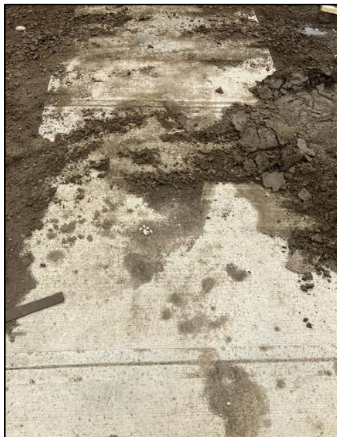
Unacceptable picture -sidewalk panel covered with debris