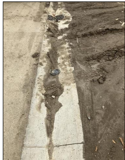
Unacceptable picture – curb panel covered with debris